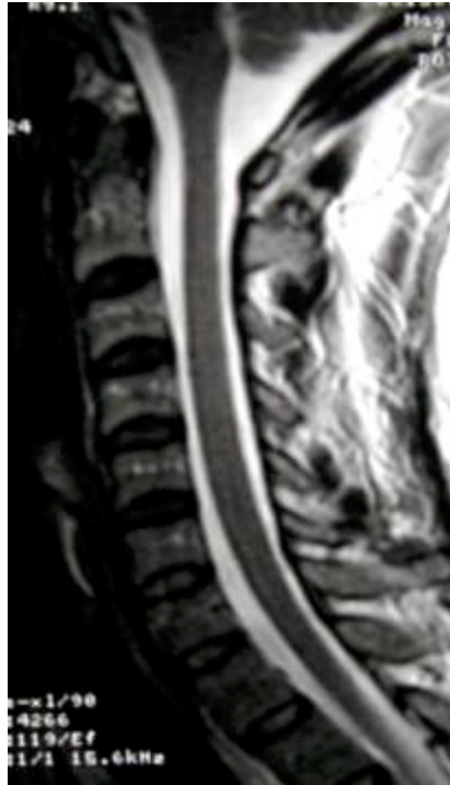
Normal MRI showing white band of fluid (CSF) around spinal cord.